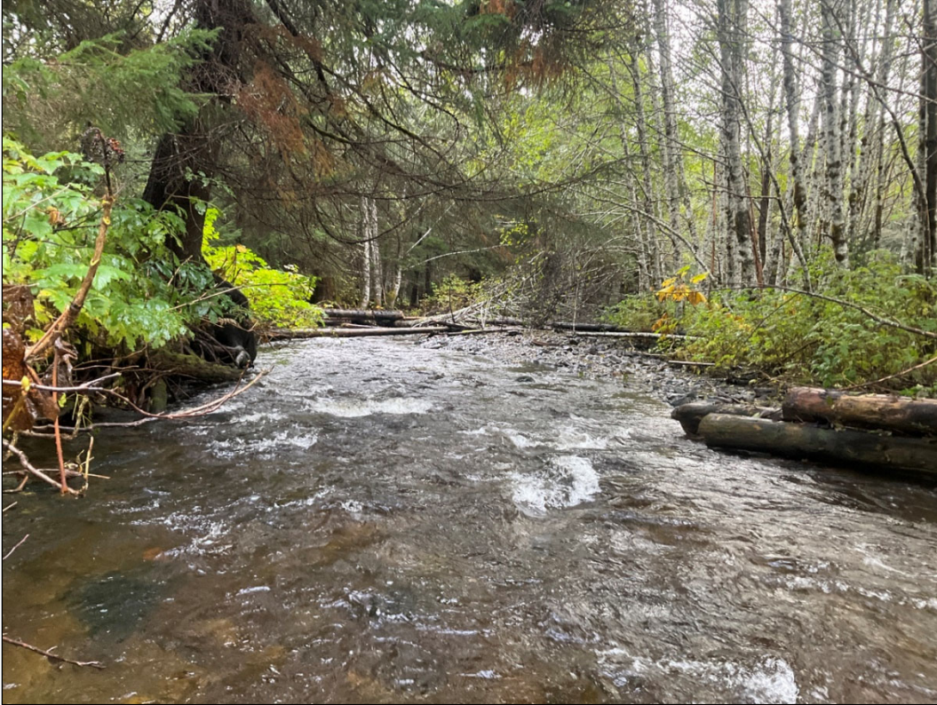
Figure 2.—Downstream view of channel at waypoint 986.