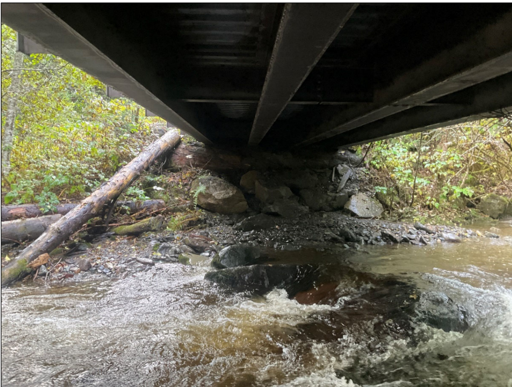
Figure 3.—Bridge abutment at waypoint 986.