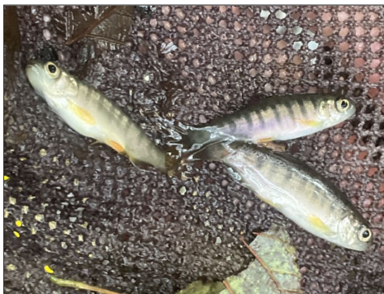
Figure 1.–Juvenile coho salmon captured at waypoint 987.